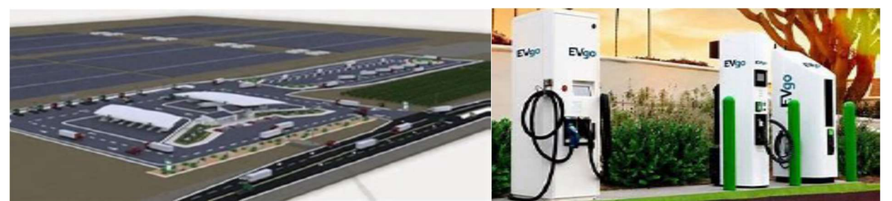
Solar generation field on the southern parcel and a set of 10 natural gas generators as backup power.

The development of the WattEV site is expected to take 6-8 months. The backup generators and solar field will be installed in stages over 24 to 48 months as operations increase.