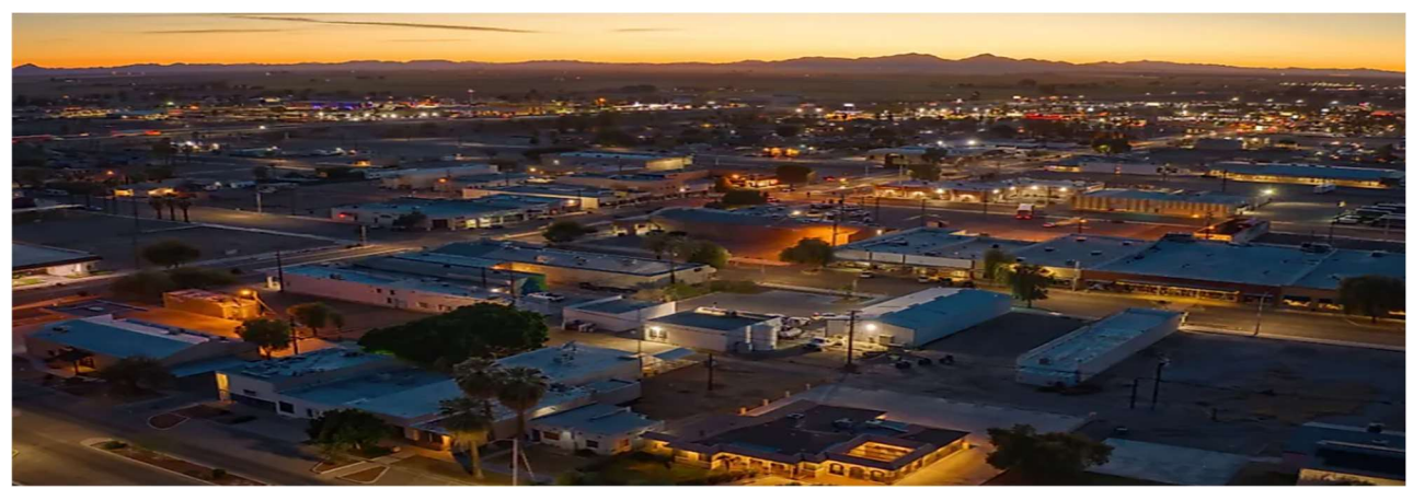
Downtown Blythe California at Dusk in the Imperial Valley," <sup>63</sup>

Although this definition would seem to preclude it from meeting the criteria as a Gateway City in the foreseeable future, Blythe's ongoing work to enhance its financial status, improve its image aesthetically, and to attract new business enterprises, should improve its station as just an isolated, distant town near the Arizona border.